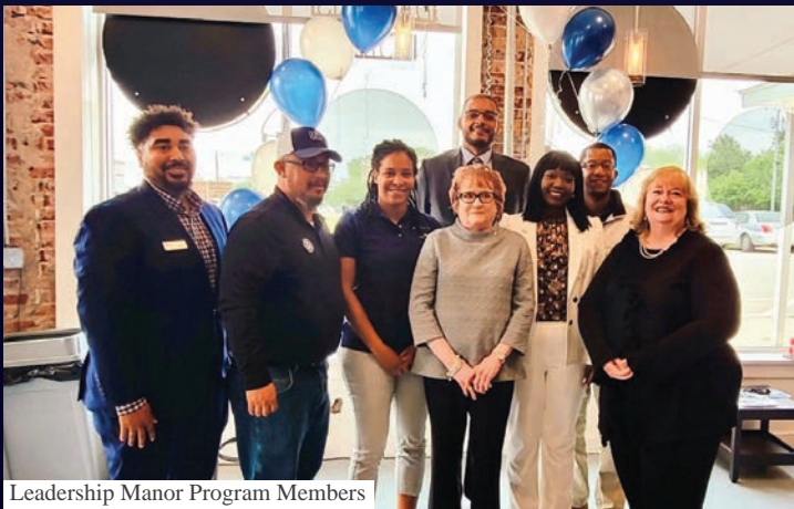
Leadership Manor Program Members